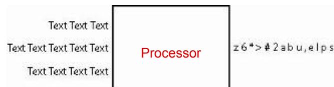
Figure 4: Hardware-based Encryption [5]

Bottlenecks do not occur during hardware-based encryption because there is real time encryption processing. This makes hardware-based encryption faster than software-based encryption.