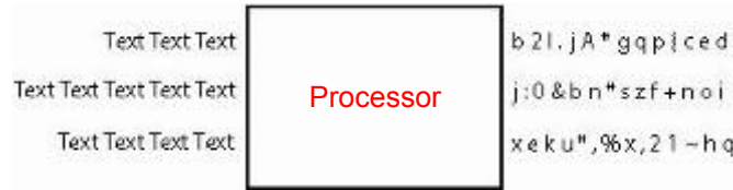
Figure 3: Software-based Encryption Process [5]

The encryption process is slower than hardware encryption because bottlenecks occur when unencrypted data is processed into encrypted data due to the strain it puts on the processor. Bottleneck size increases as the amount of files to be encrypted increases [5] .